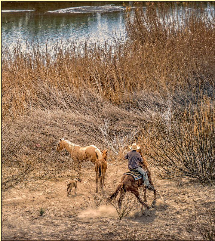
Best of Show “Across Rio Grande We Go” and “Image of the Year” Mater Category Rhonda Pummill