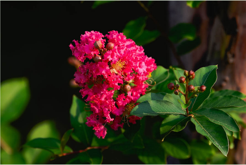
Basic: J.B.Lilly “Crepe Myrtle”