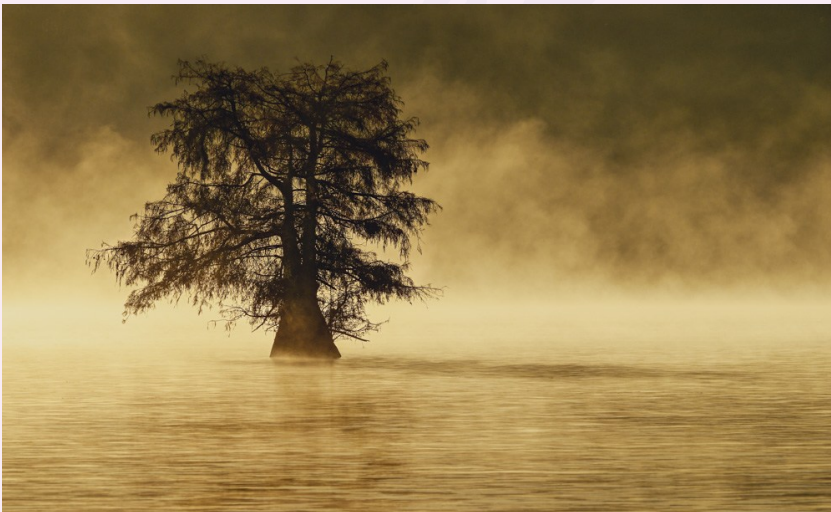
Lone Cypress in Fog Caddo Lake